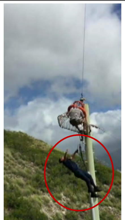
Firefighter falling from Rescue Basket during short haul operation in Hawaii.

After dropping off the patient, the medic told the pilot he believed they had lost a blanket in flight. The medic had secured the blanket loosely under the foot strap. The medic decided not to say anything, thinking it would distract the pilot.