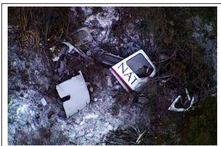
A paramedic survivor of this accident attempted lifesaving measures on one of the victims who showed signs of life, but was unsuccessful.

to reach - a military helicopter rescued the survivor.