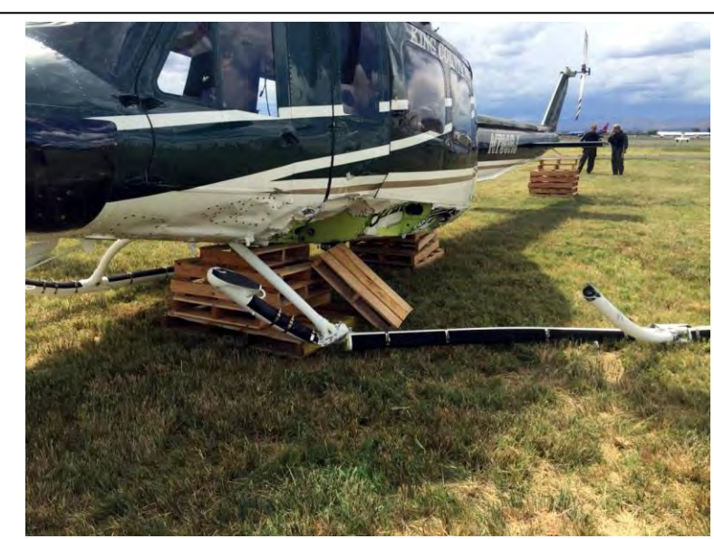
Damage to the King County Sheriff's helicopter sustained during contact with the ground. Pallets were arranged at a local airport to allow for a safe landing with damaged skid.

Firefighters arranged wooden pallets to balance the damaged helicopter on landing.