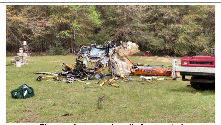
The wreckage was heavily fragmented with only the aft fuselage being generally recognizable.

The three-person team consisted of a rescue specialist, a system operator, and a safety officer. The team members rotated positions. The accident flight was the seventh iteration, and the first flight where the fatally injured crewmember was system operator.