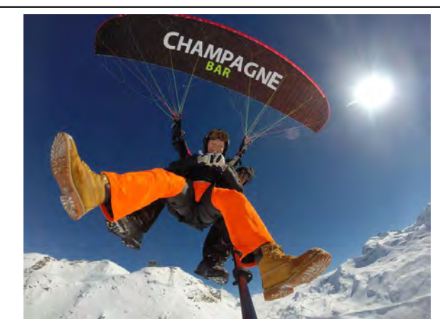
Paragliders are operating in helicopter airspace at a growing rate, in Europe especially

During a night time HEM mission in north Slovakia the pilot landed to pick up a patient at a small landing zone on a ridge top (below tree line). The patient (with a broken leg) was loaded on board and the aircraft departed. After takeoff, approximately 30-45 seconds into flight,