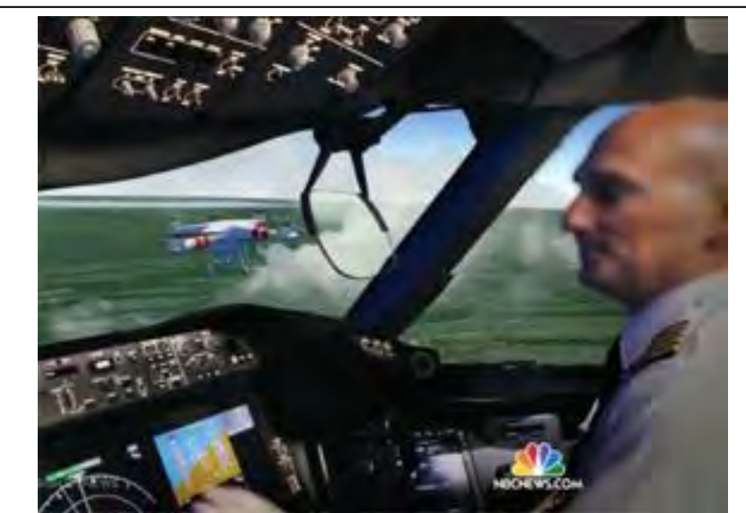
Drones are quickly becoming a worsening problem for all HEMS programs