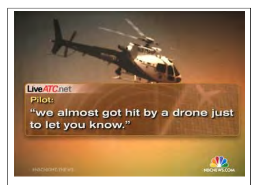
A HEMS helicopter in Fresno, California (USA) had a near miss with a drone in 2016.

A total of 10 incidents between drones and helicopters was reported during 2016, including one at night in a controlled airspace. All were close calls, but no contact was made. It was reported that EASA will be introducing prototype recommendations governing drone use.