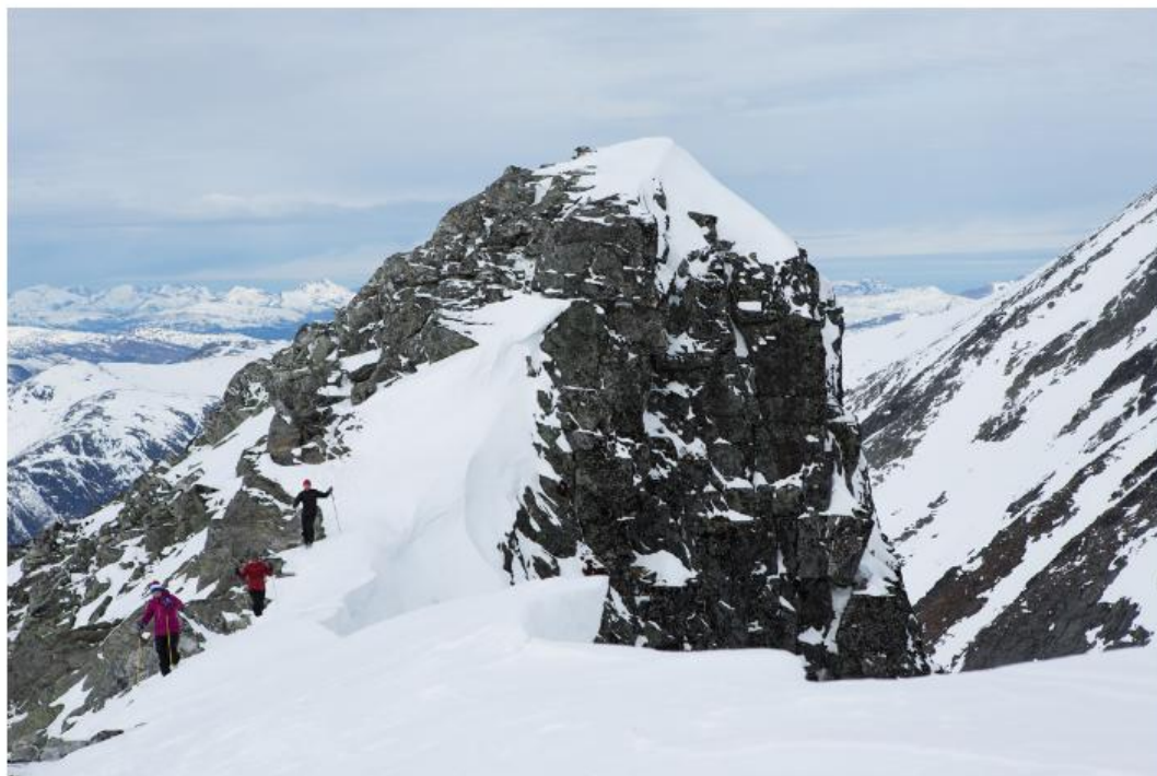
SKAVLBRUDD: På dette arkivbildet ser du toppen av Litlskjorta - og øverste del av stupet hun falt utfor.