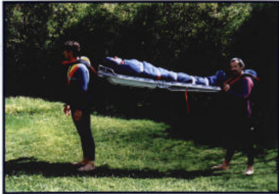
PORTAGE D'UNE VICTIME PAR 2 SAUVETEURS