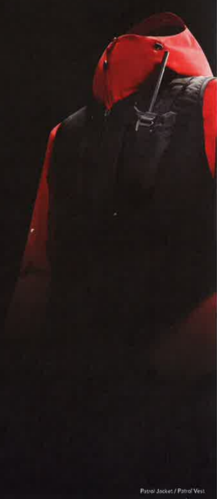
Patrol Jacket / Patrol Vest