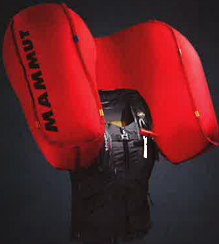
Alyeska P.A.S. Vest- 4L