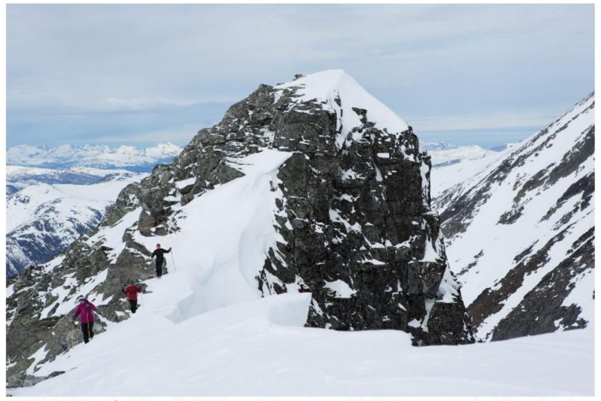
SKAVLBRUDD: På dette arkivbildet ser du toppen av Litlskjorta - og øverste del av stupet hun falt utfor.