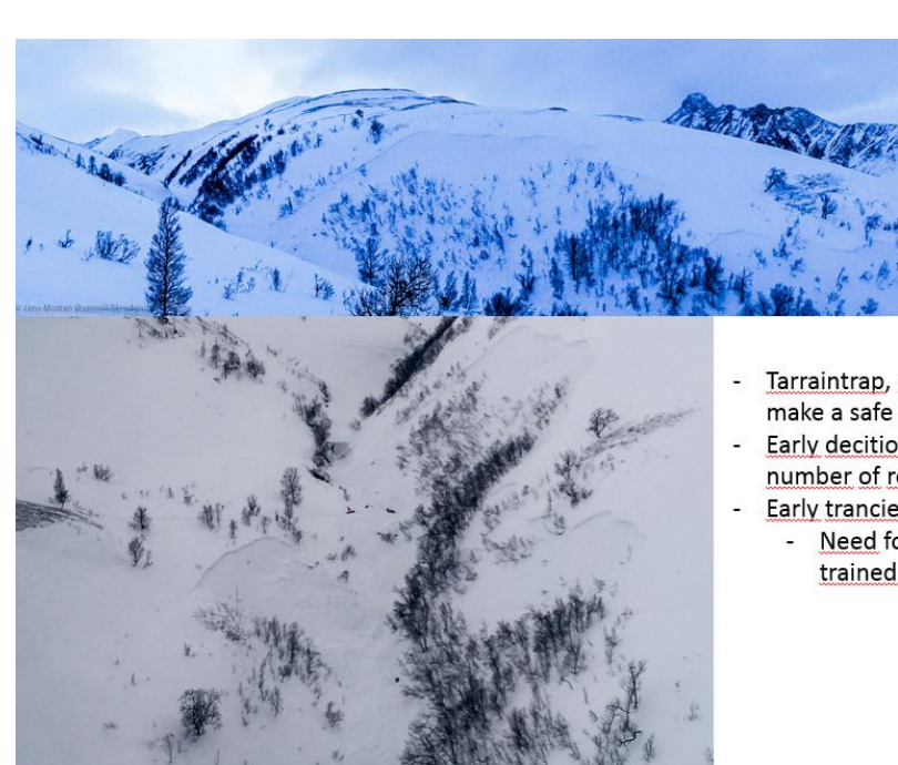
Tarraintrap, difficult to make a safe approach.