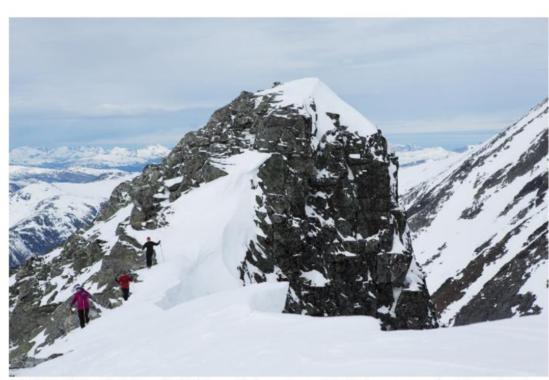
SKAVLBRUDD: På dette arkivbildet ser du toppen av Litlskjorta - og øverste del av stupet hun falt utfor.