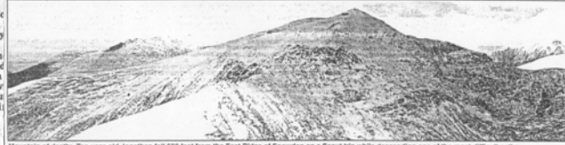
Mountain of death: Ten-year-old Jonathan fell 600 feet from the East Ridge of Snowdon on a Scout trip while descending one of the most difficult paths