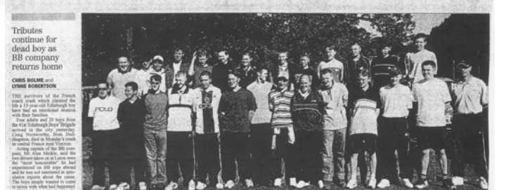
Survivors of the Frank Beck tragedy gathered for an emotional reunion with their families. The first survivors of the Frank Beck tragedy which claimed the life of a 10-year-old boy, have had an emotional reunion with their families.